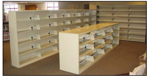
The self service holds area while under construction

To use a self-check machine, you will need your library card and your PIN number. (Don't know your PIN? A staff member will be happy to provide you with it.)