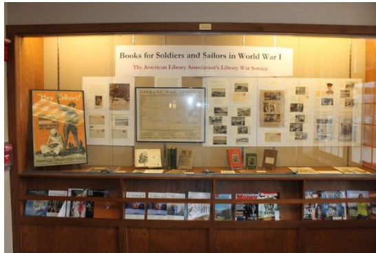
WWI Libraries Display