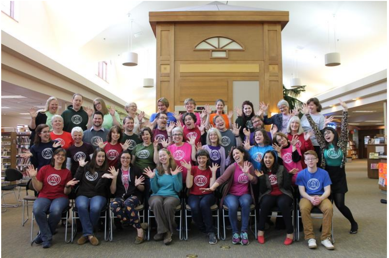
2017 Middleton Public Library Staff!