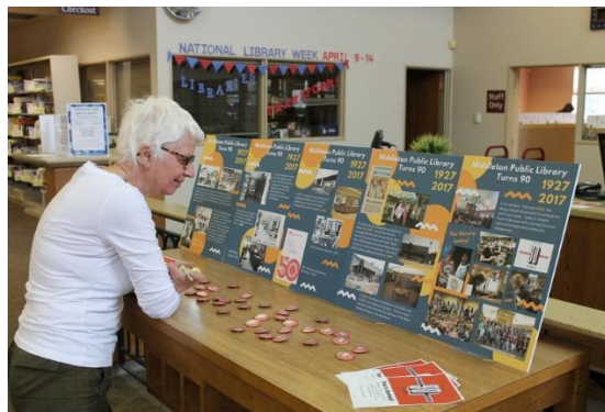
Middleton Public Library Timeline