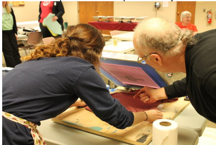
Staff Development 90 th Anniversary Screenprinting