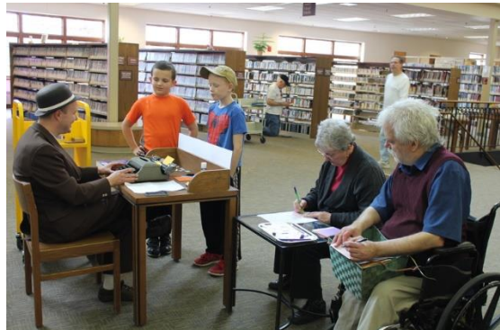
Poetry Express Station