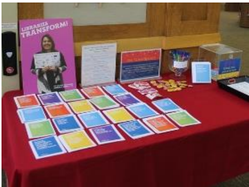
Library Love Letters to Legislators