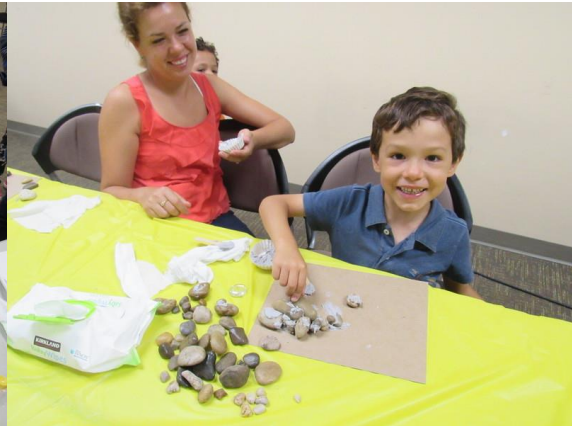
Book Bunch: The BFG