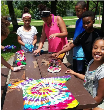
Outreach: Youth Center