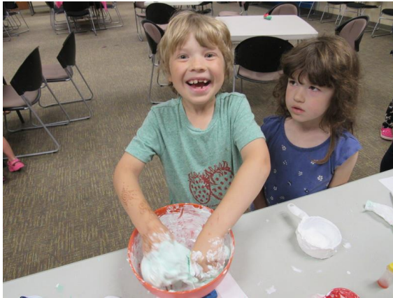
Book Bunch: Fluffy Slime