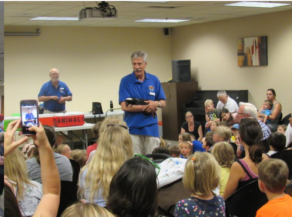
The Henry Vilas Zoo