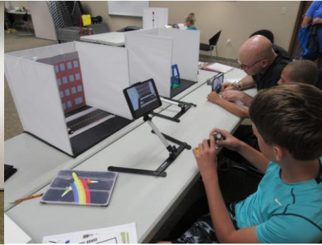
Stop Motion Animation