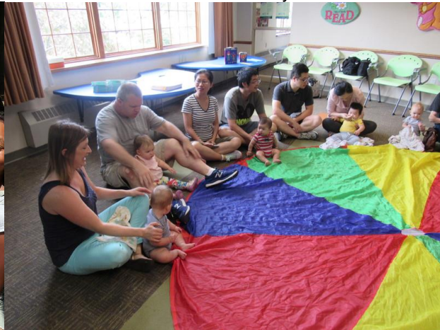
Storytime: Baby Lap