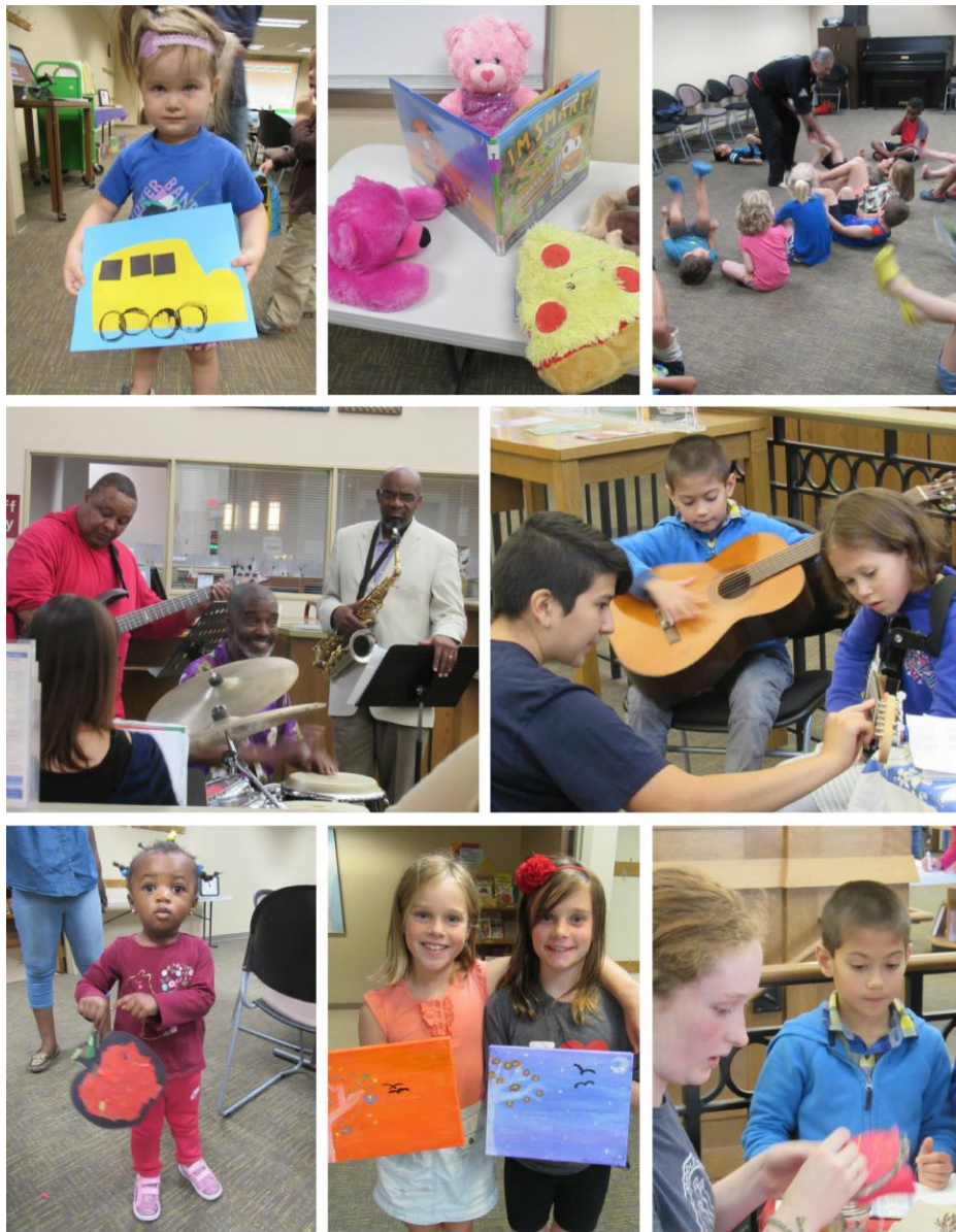
Top (from left): Little Kids Storytime – Bus, Stuffed Animal Sleepover, Martial Arts Middle: Strollin’ Middleton Jazz Festival, How-To Teen Maker Faire Bottom: Little Kids Storytime – Apples, Tween Paint Night, How-To Teen Maker Faire