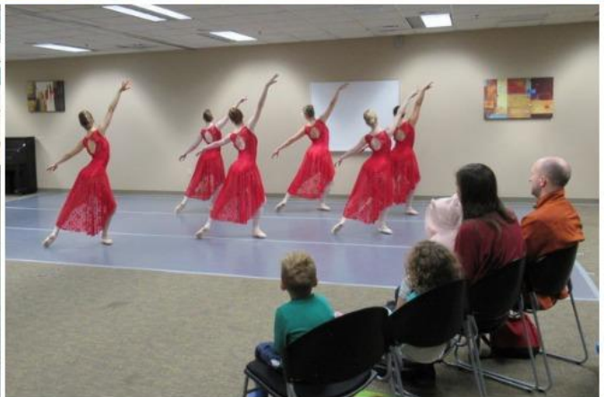
Top: Halloween Trick or Treat, Tween Paint Night, Little Kids Storytime – Skeletons Middle: Greenway Station Storytime, Haunted Library Set-Up, KEVA Storytime Bottom: WLA Conference, Magnum Opus Ballet