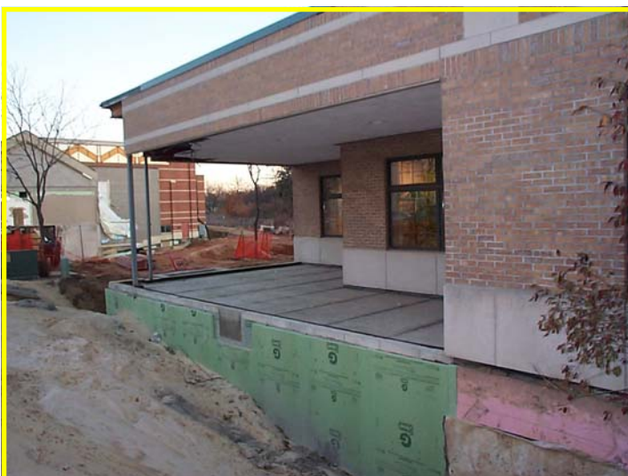
Northeast corner of the library. Constructing the Kenneth J. Mack Reading Room

Phase 2 of the renovation project is scheduled to start on Monday, February 2, and continue through Sunday, February 29. This phase will include the painting and recarpeting of the main level, as well as a reconfiguration of the children's, teen, and adult popular materials sections of the library.