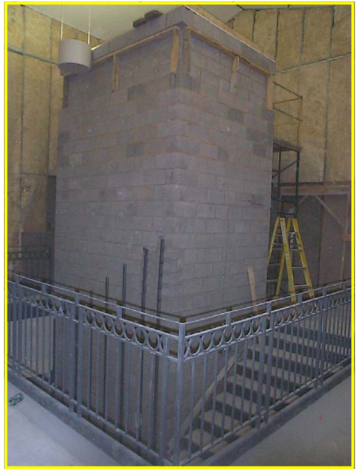
The unfinished elevator tower and stairwell