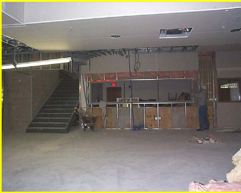
Future Reference Desk area. Computer Lab room will be behind the Reference Desk.