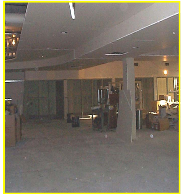
Lower level, as seen from the Reference Area, looking towards the 4 private study rooms along the far wall.