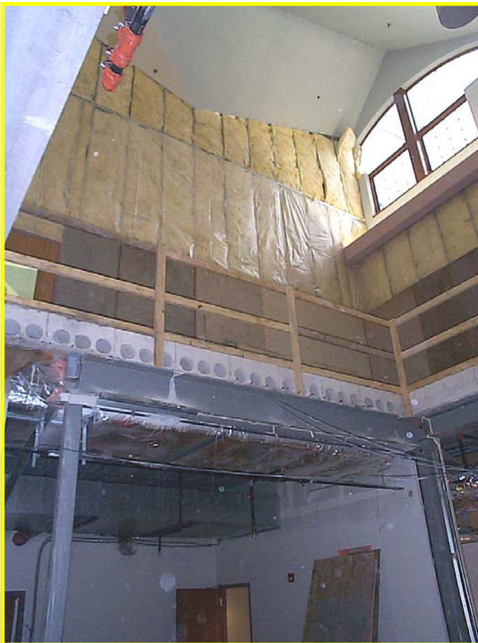
Our "hole in the floor" before the elevator and stairway were installed.