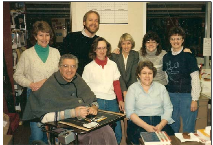
MIDDLETON PUBLIC LIBRARY STAFF (1987)