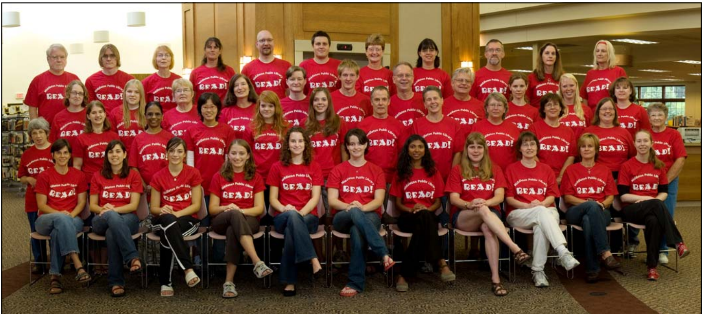
The Staff of the Middleton Public Library