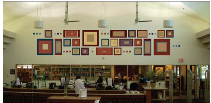
(Rendition of proposed mural)

Thank you for supporting Middleton Public Library!